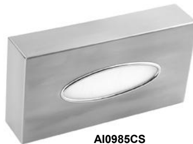
AI0985CS Satin finish