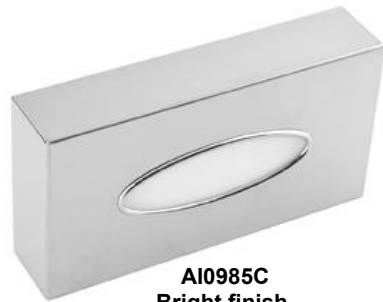
AI0985C Bright finish